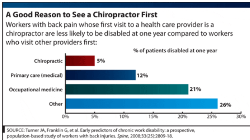
Table 1. 1

On behalf of a united chiropractic profession, this paper is offered as a means to substantively contribute to the national healthcare reform debate, to help foster timely action on key health reform principles, and to offer a new perspective on how a system in crisis can be redesigned into one that works, in which the public has confidence and which the nation and its citizens can afford.